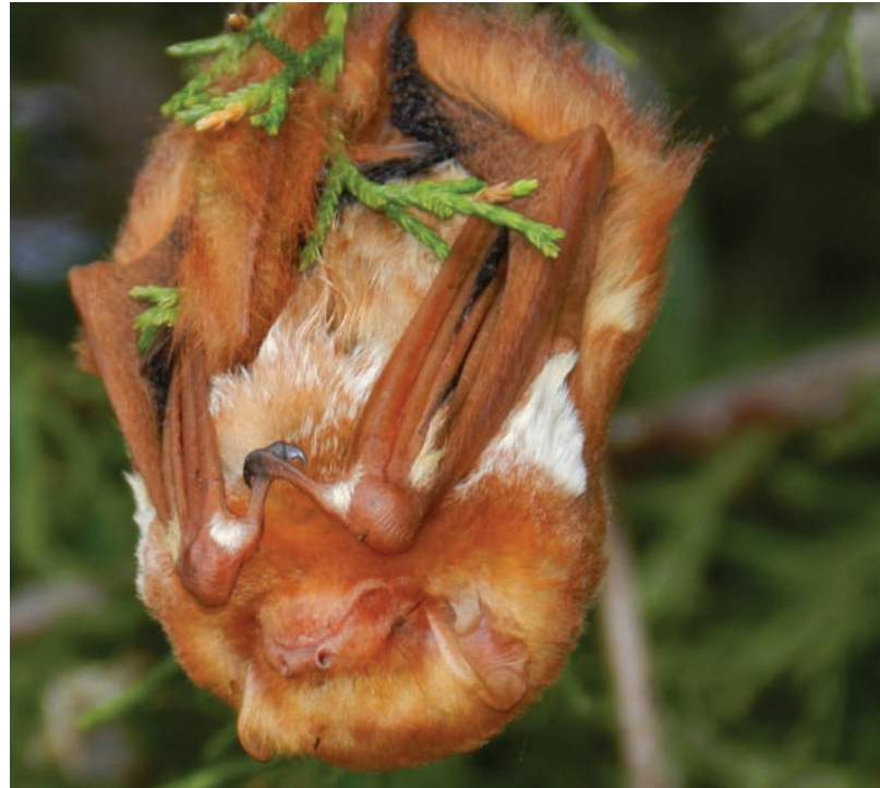
EASTERN RED BAT

It is unclear to what extent this conclusion reflects sample bias, as there are few reports available from the southwestern U.S. (especially Texas and Oklahoma where there is high installed wind capacity) where a very different bat fauna is present than at most other facilities in the U.S. Higher percentages of cave dwelling bats have been recorded at wind energy facilities in the Midwest compared to other facilities in the U.S. (Jain et al. 2011), and the few available studies