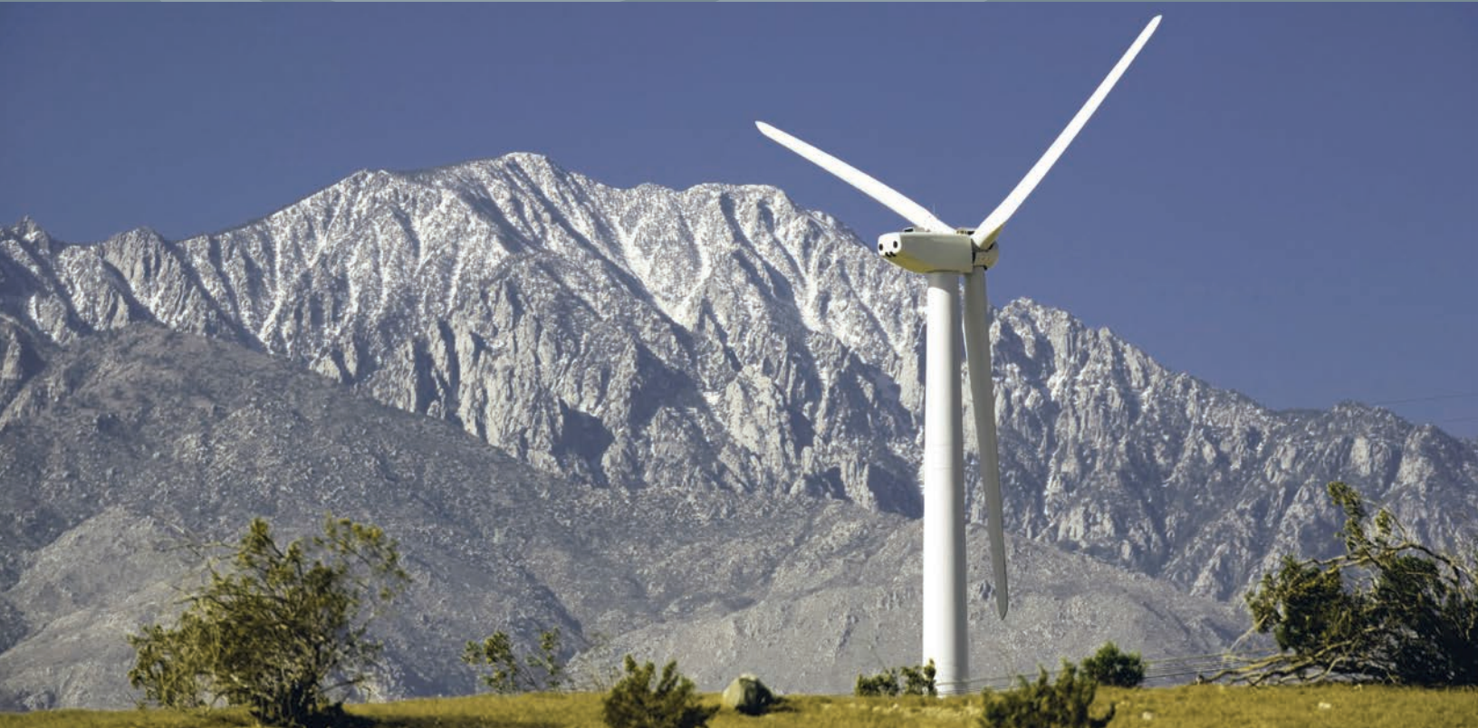
DILLON WIND POWER PROJECT, PHOTO BY IBERDROLA RENEWABLES, INC., NREL 16105