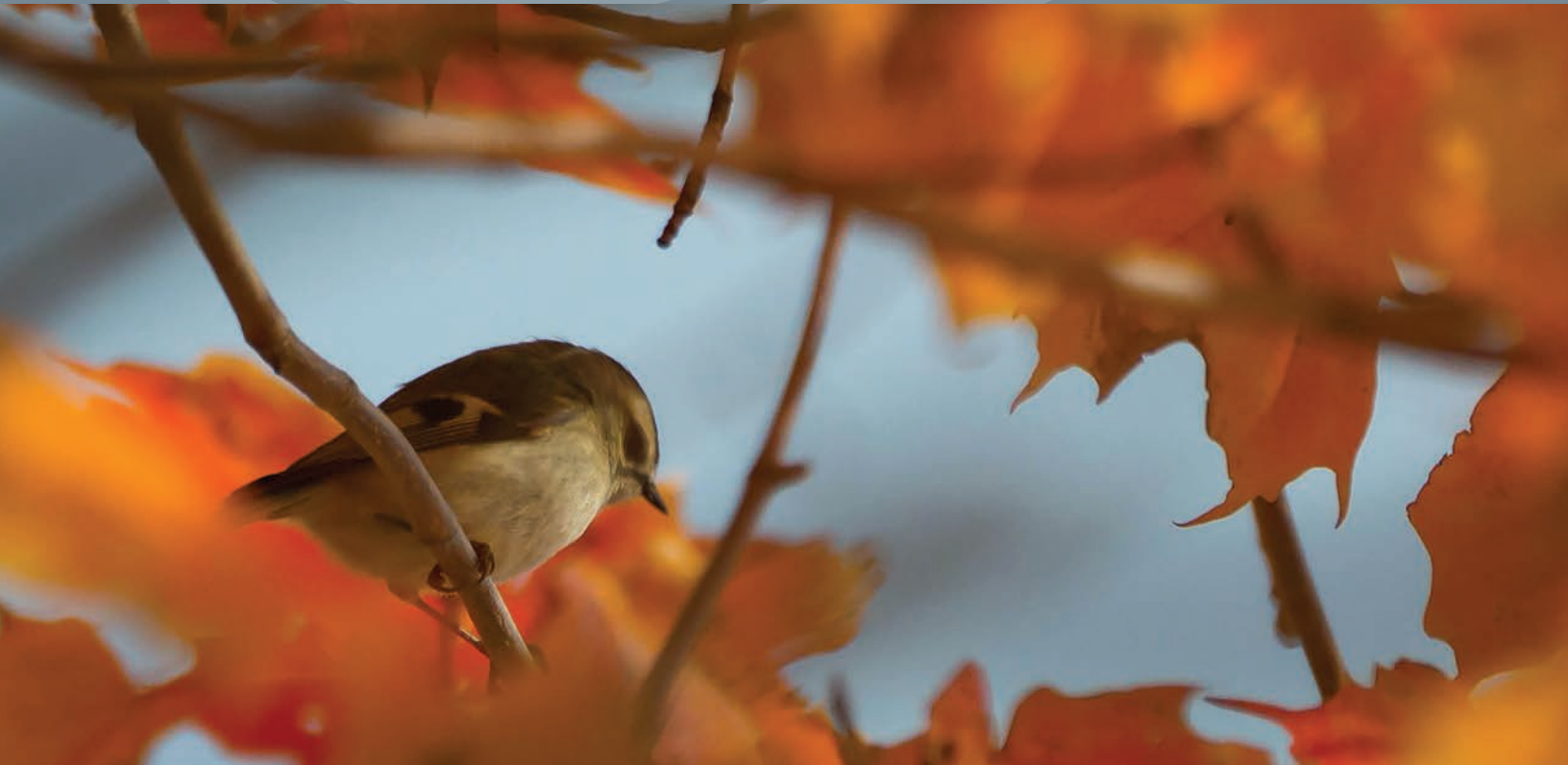
GOLDEN-CROWNED KINGLET, PHOTO BY ZANATEH, FLICKR