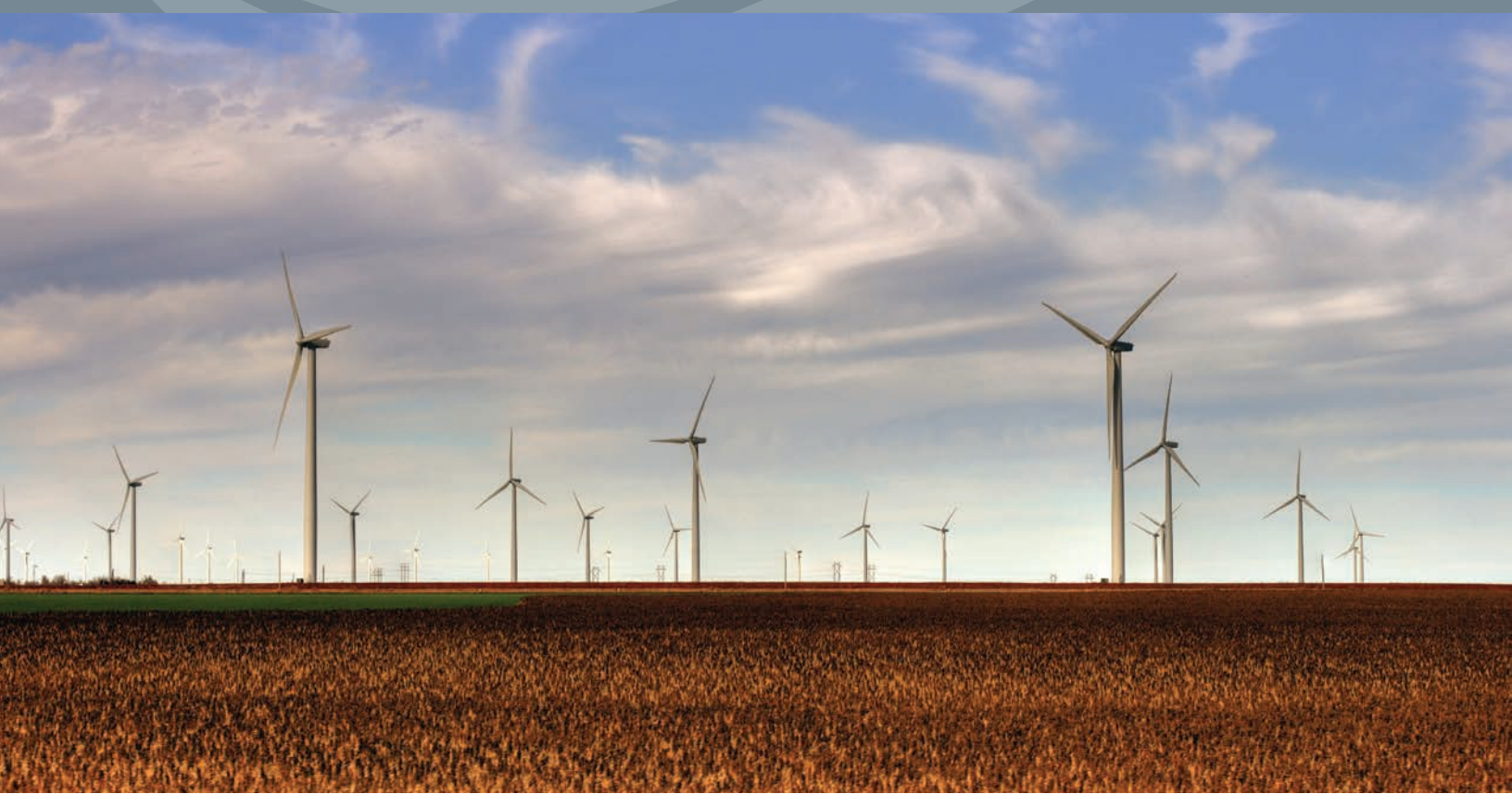
SMOKY HILLS WIND FARM