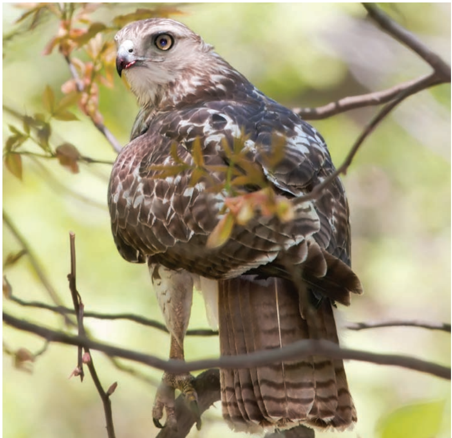
JUVENILE RED-TAILED HAWK, PHOTO BY KELLY COLGAN AZAR, FLICKR

The use of radar and bat acoustic detectors is a common feature of pre-construction risk assessments for siting wind energy facilities (Strickland et al. 2011). To date, studies have not been able to develop a quantitative model enabling reasonably accurate prediction of collision risk to birds and bats from these surveys (Hein et al. 2013). Predicting bat collision risk using pre-construction activity measures would be further complicated if bats are attracted to wind turbines (see above).