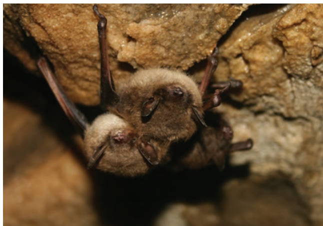
LITTLE BROWN BATS