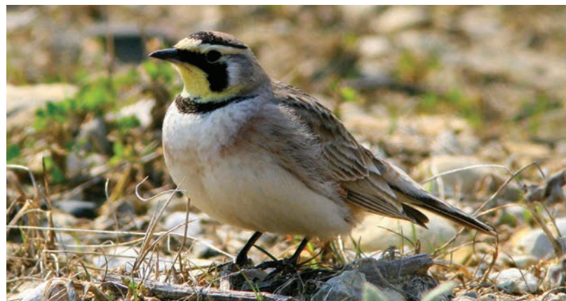
HORNED LARK

Several recent estimates indicate that the number of birds killed at wind energy facilities is a very small fraction of the total annual anthropogenic bird mortality and two to four orders of magnitude lower than mortality from other anthropogenic sources of mortality, including feral and domestic cats, power transmission lines, buildings and windows, and communication towers (Longcore et al. 2012; Calvert et al. 2013; Loss et al. 2014a,b,c; Loss et al. 2013a,b; Erickson et al. 2014).