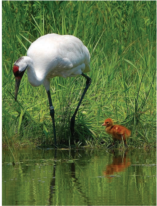
WHOOPING CRANES, PHOTO BY GILLIANCHICAGO, FLICKR

Experimental trials have shown that ultrasonic devices can reduce bat activity and foraging success, and evaluation of similar devices installed on wind turbines has shown some reduction in bat fatalities over control turbines (Arnett et al. 2013a). Development of bat deterrents using both acoustic