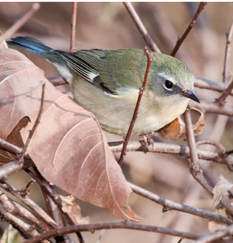
BLACK THROATED BLUE WARBLER

This section outlines what is known and where there is remaining uncertainty about the patterns of bird and bat collision fatalities, particularly in the continental U.S. We first examine patterns that apply to both birds and bats and then describe patterns specific to birds and specific to bats.