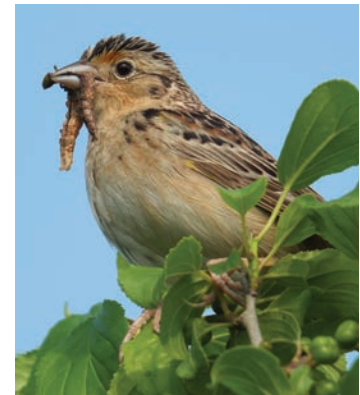
GRASSHOPPER SPARROW

Construction of single utility-scale turbines (1.5-2 MW) is growing rapidly in some regions of the country, especially where opportunities for large utility-scale projects are limited or municipalities often supply their own electricity (e.g., Massachusetts). Fatality monitoring at single-turbine facilities is often not required, and published reports have not been available.