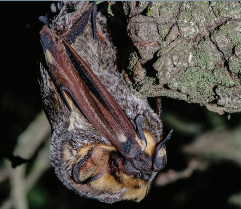
HOARY BAT

turbines from the leeward direction, especially at low wind speeds (Cryan et al. 2014). Analysis of bat carcasses beneath turbines indicate that bats are foraging for insects around wind turbines (Bennett et al. 2017; Foo et al. 2017). Large percentages of male hoary, eastern red, and silver-haired bats carcasses found during periods of high fatality levels were at sexual readiness (Cryan et al. 2012).