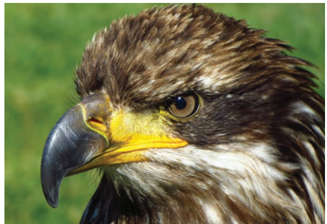
GOLDEN EAGLE

Fatalities of waterbirds and waterfowl, and other species characteristic of freshwater, shorelines, open water, and coastal areas (e.g., ducks, gulls and terns, shorebirds, loons